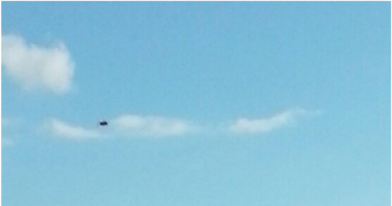
Izmail, Ukraine - July 14, 2014