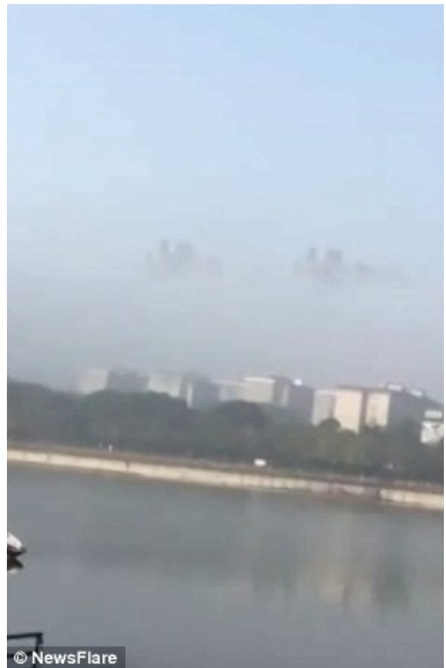
3. October 19, 2015, Jiangxi Province, China