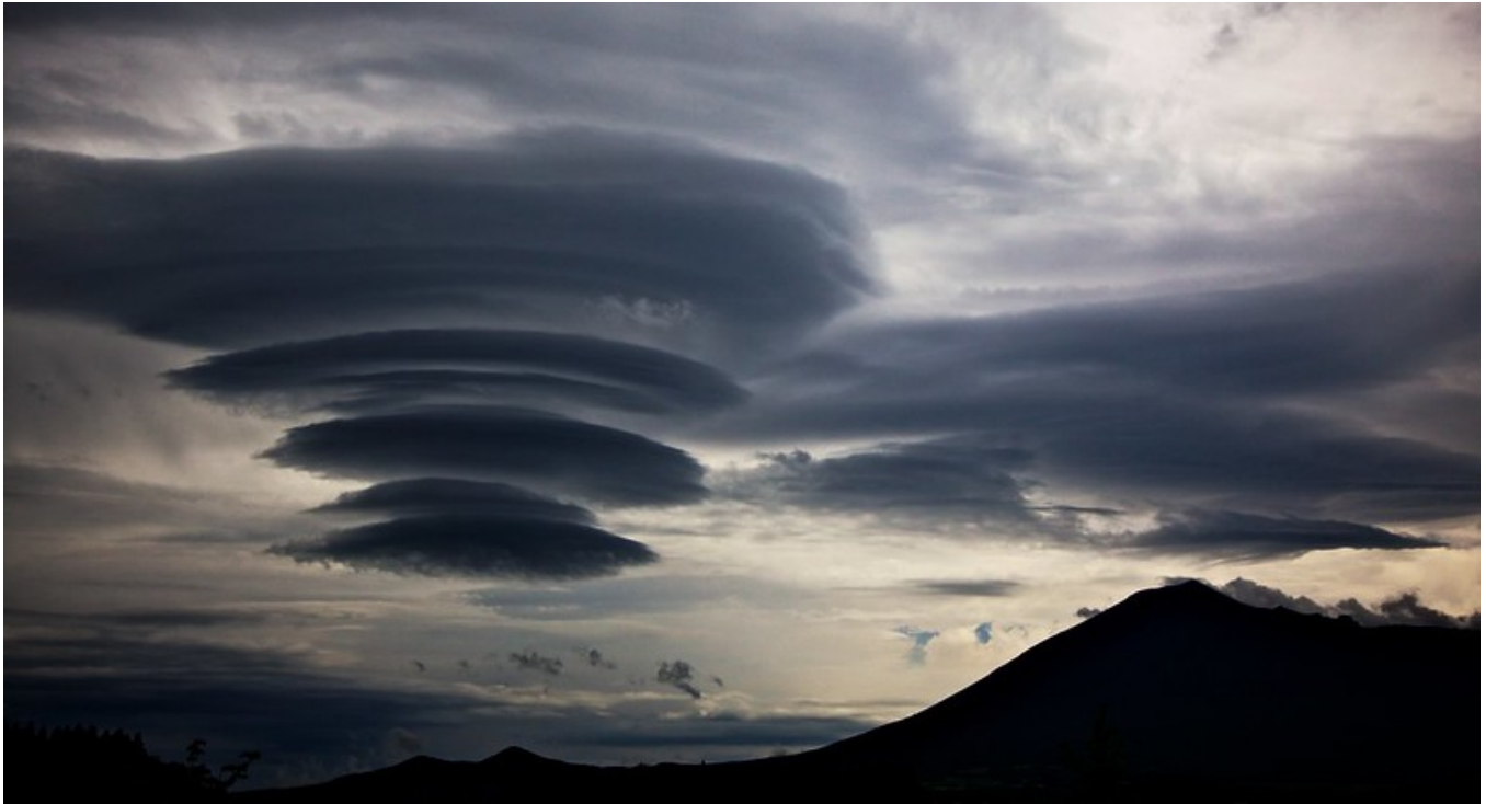
3. November 18, 2013 - Alpujarras, Andalusia, Spain